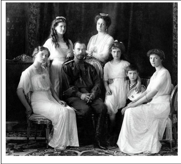
Tsar Nicholas II and his family

In 1894 Nicholas II became Emperor (Tsar) of Russia. He belonged to the Romanov family that had ruled Russia since 1613.