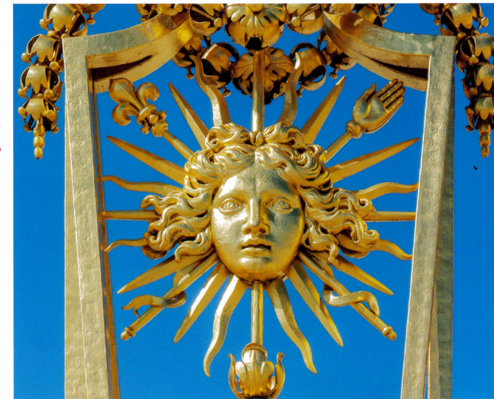
The symbol of Louis XIV as the Sun King is used on the golden gate at the Palace of Versailles

WJEC Unit 1, Part 6 Europe in the age of absolutism and revolution c.1682–1815