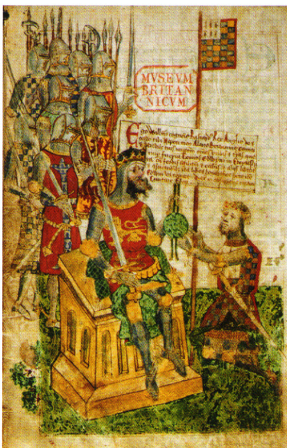
Under the feudal system nobles had to swear an oath of loyalty to the king

From the Battle of Hastings in 1066 until the signing of Magna Carta in 1215, England was run as a feudal system. This meant the king effectively owned all the land and everyone had to swear an oath of loyalty or 'fealty' to him. The king would give land to the nobles who would use knights to manage it for the king. In return, the nobles would supply an army to the king if the country needed it. Over time, rather than supply an army, the nobles began to supply cash instead. To work out what the nobles owed, the king's chancellor would use a huge chequered mat (like a giant chess board) to calculate the amount of money owed, hence the title the ' chancellor of the exchequer '.