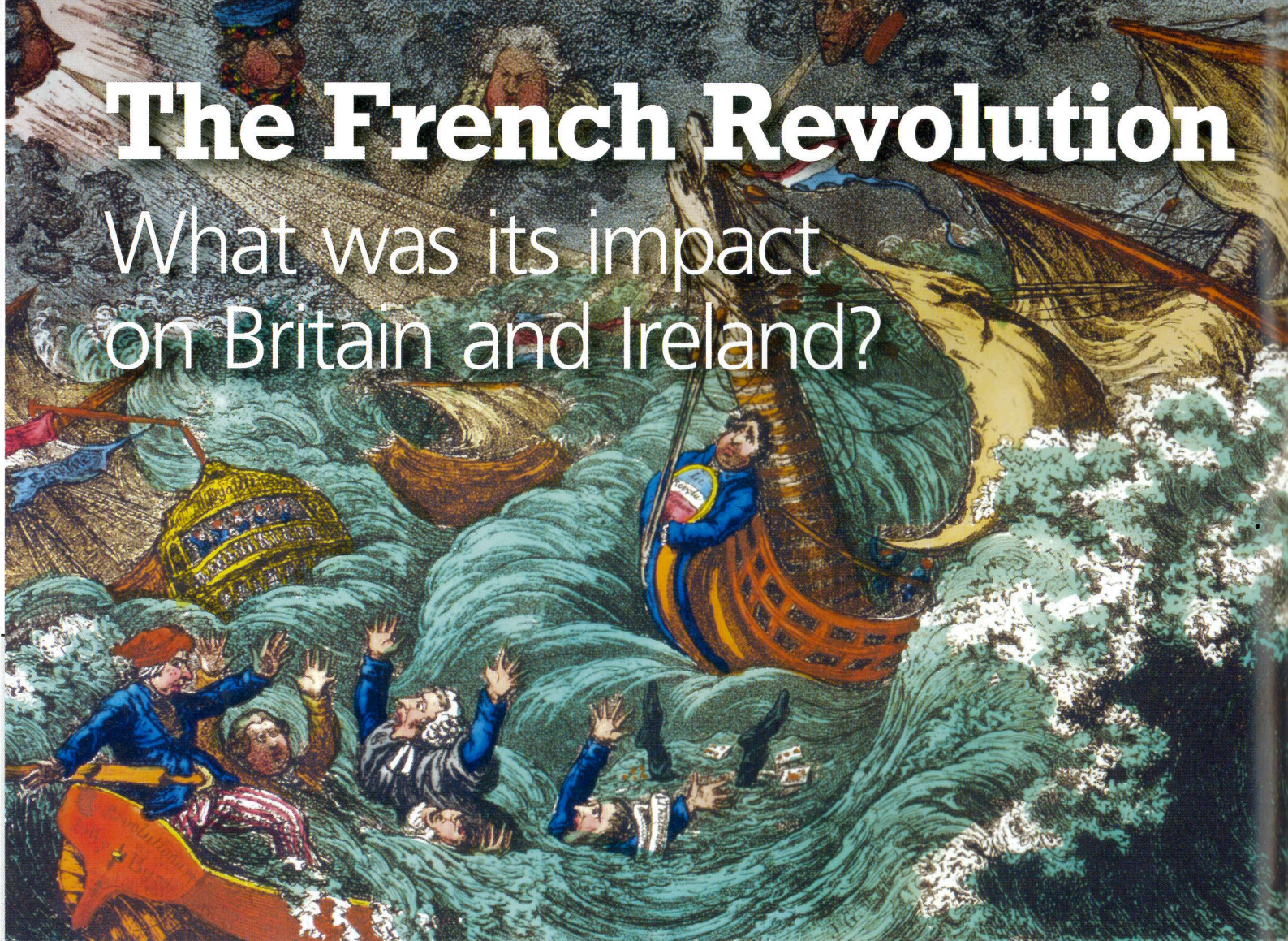
The attempted landing of French forces at Bantry Bay in Ireland, 1797