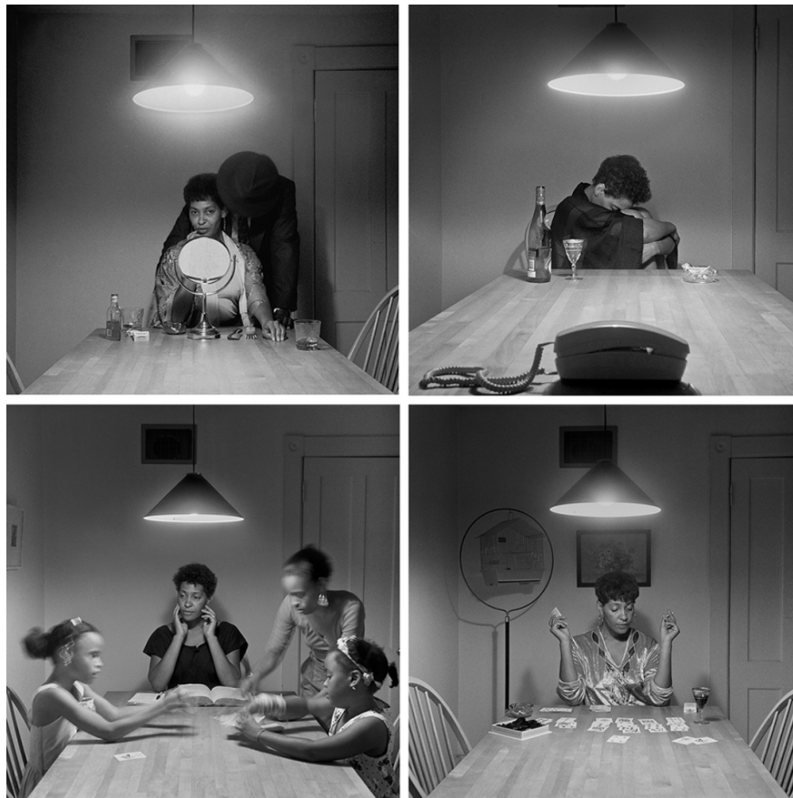
'Kitchen Table Series' by Carrie Mae Weems

GOOD LUCK!!! We look forward to seeing you in your Photography classes in September.