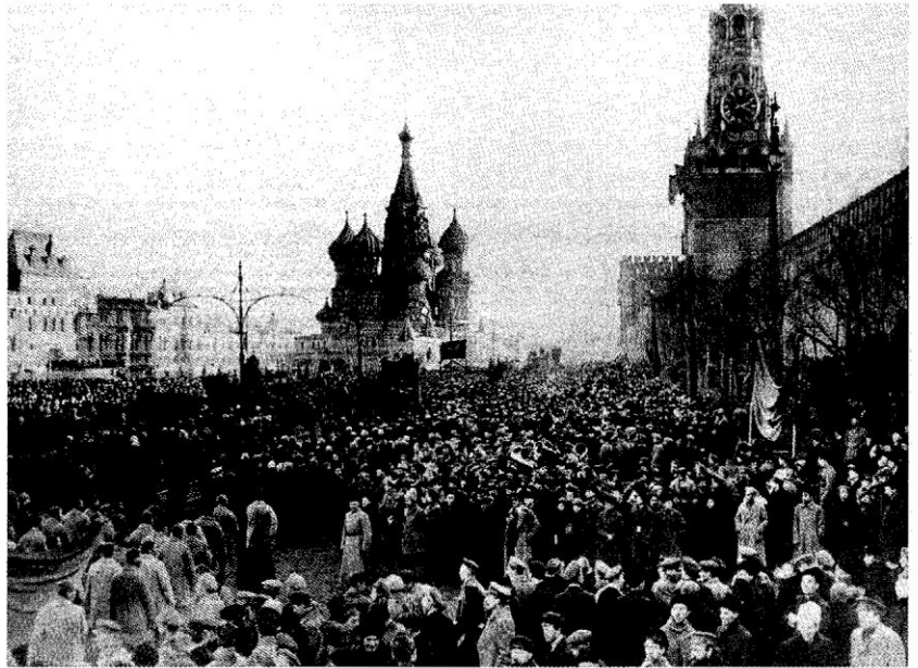
Fig. 1 Russia was considered backwards in the early twentieth century

The nineteenth and early twentieth centuries had seen huge industrial and political advances in Western Europe. The development of new forms of energy, the spread of railways and the expansion of trade together with advances in medicine and improvements in public health had helped raise living standards for an increasing proportion of the population. Alongside such change, social and political advances had occurred. Standards of literacy had increased, the old social hierarchies had broken down and an increasing number of people had gained the right to vote for a law-making assembly.