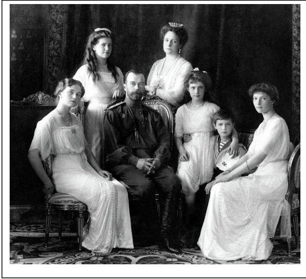
Tsar Nicholas II and his family

In 1894 Nicholas II became Emperor (Tsar) of Russia. He belonged to the Romanov family that had ruled Russia since 1613.