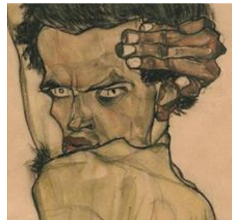
Egon Schiele Self portrait with arm twisting above head 1910

So, let's talk about Egon Schiele and this work, in some more detail. This image was created in 1910 when Schiele was just 20 years old. If we look at the medium that it's created in, we can see that there is gouache, there's watercolour, charcoal and pencil on paper, so it's a mixed media artwork. The charcoal and pencil are used to describe the rather angular, distorted forms of the human body, bony, skeletal forms in very simple, suggestive lines. Gouache and watercolours are used to create these soft hues on the skin of the body, to describe the form.