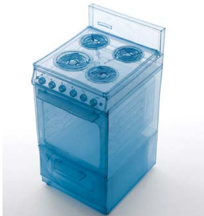
Do Ho Suh household objects