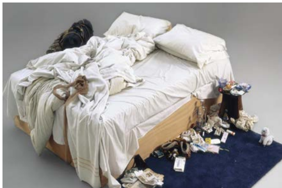
Tracey Emin's bed