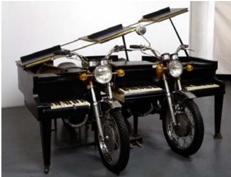
Arman - The Spirit of Yamaha, 1997, Sliced grand piano with Yamaha motorcycles