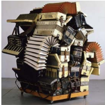
Arman - Nuits de Chine, 1976