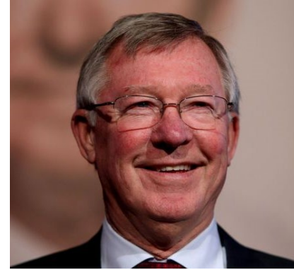
Sir Alex Ferguson