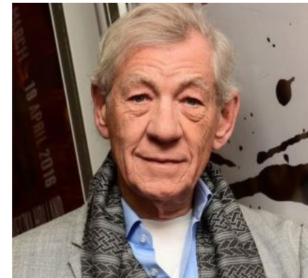
Sir Ian McKellen